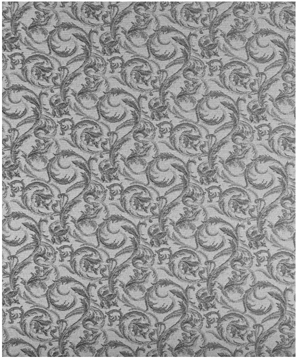
Pattern not shown to scale. This is a general represenation of the overall appearance of the design shown in multiple repeats

Fabrics by Absecon Mills, Inc. Fabric performance symbols indicate that a fabric performs to commercial furniture manufacturing standards and passes all applicable testing as specified by the Association for Contract Textiles (ACT).