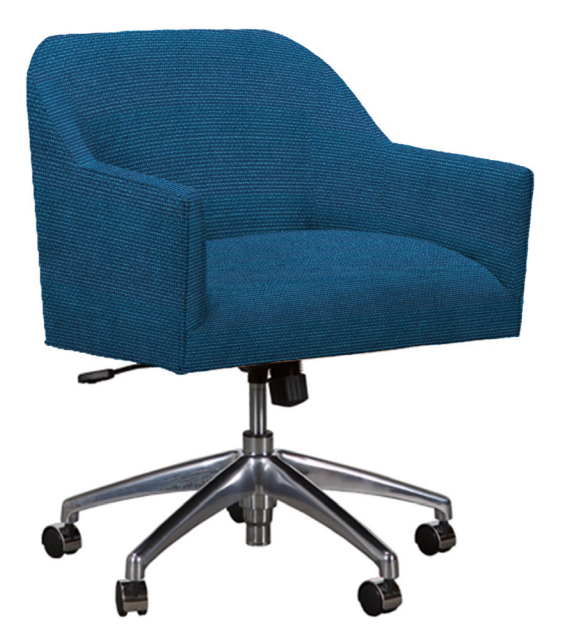
Shown in North Sea Colorway

email samples@absecon.com or call 1-877-356-4557