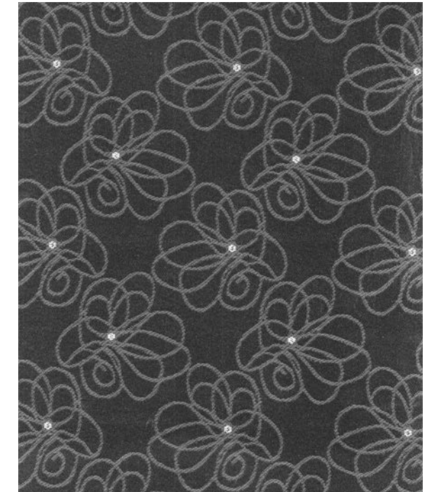
Pattern not shown to scale. This is a general represenation of the overall appearance of the design shown in multiple repeats.