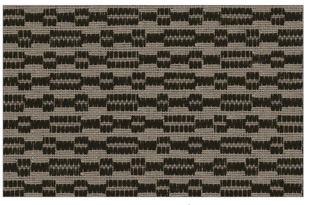
FORCE DARK - Platinum